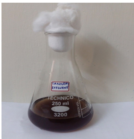
Control- Untreated tannery effluent sample