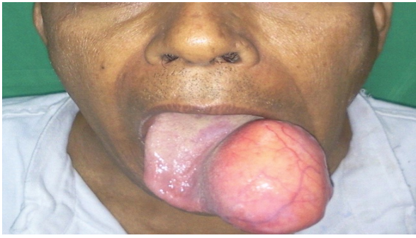
Figure 1. Large Lingual Lipoma