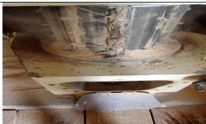
Figure 5. RINI bleaching sieve, in poor condition