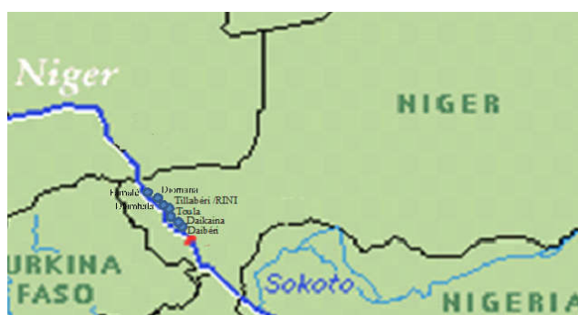
Figure 1. Location of the RINI and the sites of origin of the paddy rice all-coming (Famalé, Diomana, Diambala, Toula, etc.)

Study area: The monitoring and inventory of harvesting and pre- and post-harvest operations as well as those of factors limiting rice production and quality were carried out on the rice perimeter of Toula (Figure 1). Comparative observations of harvesting and post-harvest techniques were also conducted on Daikaina and Daibéri perimeters (Figure 1). As for the monitoring and inventory of machining operations and the factors responsible for the yield and quality losses of white rice, they were conducted to the Niger Republic rice transformation company (RINI).