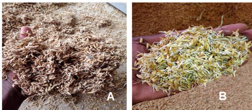
Figure 2. Moldy (A) and germinating (B) paddy