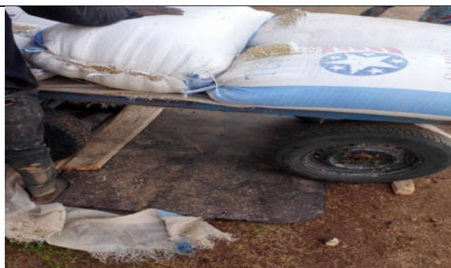
Figure 3. Paddy bags with holes on carts and paddy grains poured on to the sidewalk