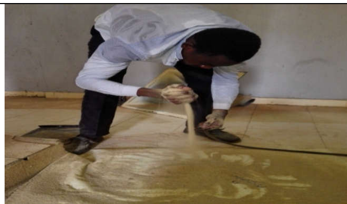
Figure 6. Using the Sound Blower