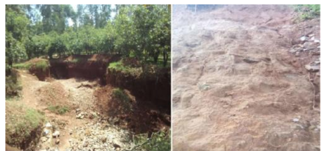
Fig. 2. Images shows land degradation

Impact on landscape and land Stability: A landscape comprises the visual feature of an area of land result in extensive manipulation of the landscape and of the ecosystems of indigenous to their sites. Disturbance to the natural contour of the topography has repercussions, not only for those communities in the immediate vicinity, but also for those adjacent.