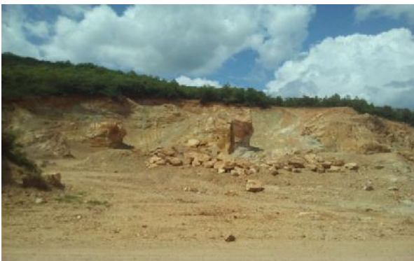
Fig.4. Impacts of quarry operation on biodiversity

Groundwater Impacts: Groundwater impacts at the site depends on soils in the vicinity of the mining area, the underlying geology, amount of rainfall, the depth of the pit, the proximity of the pit to well and aquifer and working practice. If the groundwater availability is generally good in the operation area there may be amounts of water seeping in from zone extending throughout the full face of the quarry wall. Seeps come from groundwater migration through natural and working area induced fracture in the rock. The fractures can be continuous or capable of providing a path way for significance water leakage into or out of the area. The condition extending working place near the groundwater discharge area is expected to cause notable adverse groundwater impact.