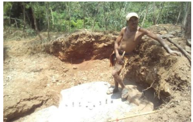
Fig. 5. Social impacts of Artisanal mining

Social Impacts of Artisanal mining: Characterizations of social, economic, and cultural impacts of mining work operation is relatively straight forward and consists of an assessment of past and current impacts and projected future effects of quarry operations at production levels. If the proposed quarry is in village or town center where surrounded by residential and recreational land of high scenic values, mining operation will negatively impact on these values. These operations are producing fugitive dusts from quarrying, vehicular emissions and other mining operation which deteriorate quality of air. The dust affects negatively the health and the pleasure of residents. The effect becomes stronger as the drier of weather, heavier of wind and increment of silt and sand together with the extracted material. The dust effect is still worse near the open quarries where rock aggregate is extracted by crushing. Dust from aggregate production is fine and needle-sharp and dust from crushed rock seems to be common cold and when breathing unhealthy.