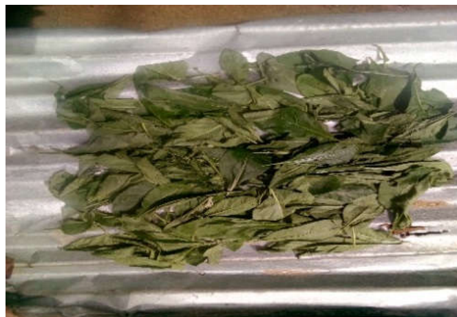
Figure 2. Sun dried leaves