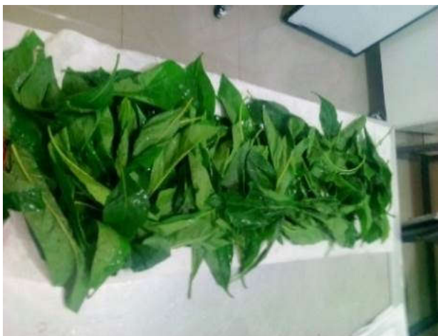
Figure 1. Fresh leaves of V.amygdalina plant