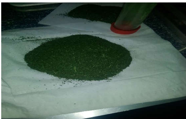
Figure 3. Mashed powder leaves