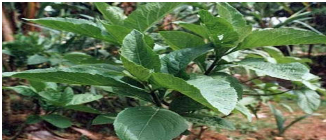
Figure 5. Vernonia amygdalina (Bitter Leaf)