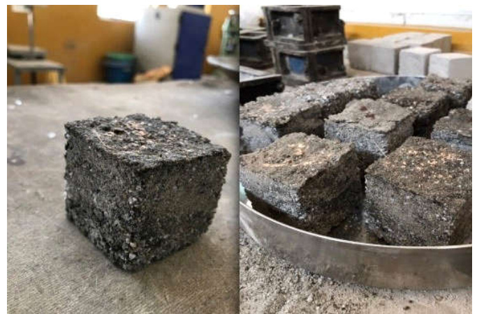
Fig. 2. Cube Samples

GPPS granules when melted and mixed with M-Sand exhibited uniform mix enabling to cast cubes. A sample with good dimensional characteristics is obtained if temperature is maintained while mixing and casting is done immediately. The density of the samples cast using GPPS and M-Sand varied from 1700 \text{ kg/m}^3 to 2100 \text{ kg/m}^3 and is in line with traditional masonry units [8]. Fig. 2 shows test cube samples of GPSS with M- sand.