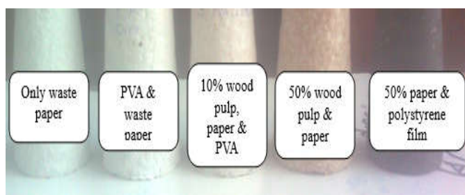
Figure 2 products of non-woven using adhesives and treated waste paper

Based on the above table 25% PVA is added additional for better adhesive ability and the product is produced and surface contour and morphology are studied. The result shows good strength at 25% ratio of polystyrene adhesive to crushed and bleached paper (Figure 2)