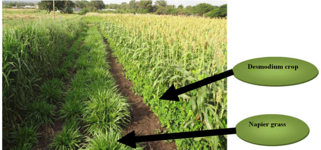
Figure 1. A Push-pull technology plot