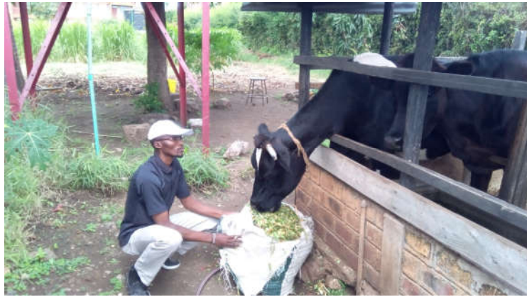
Figure 2. Cattle enjoys being fed on chopped Napier grass and Desmodium leaves