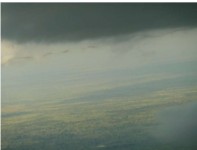
Fig. 3. typical traces of flare plumes below cloud base from a seeding experiment

The challenge however will be to perform cloud seeding experiments in vast areas and address a number of issues at a time, common nearly to all countries of the sub-region.