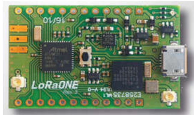
Figure 2. LoRa board

LoRa: Long range, low power wireless well-known technology choice for building IOT networks worldwide. Smart IOT applications improved the way we interrelate and are addressing some of the biggest challenges facing cities and communities: climate change, pollution control, early counsel of natural disasters, and saving lives. Businesses are benefit too, through improvements in operations and efficiencies as well as drop in costs. This wireless RF technology is being included into cars, street lights, manufacturing equipment, home appliances, wearable devices – anything, really. LoRa Technology is making world a Smarter.