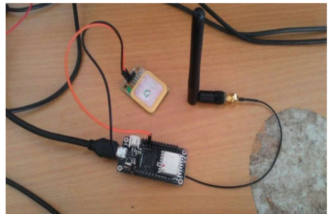
Figure 3. working of lora

A Semitic innovation, LORA Technology offer a very convincing mix of long range, low power consumption and secure data transmission. Public and private networks using this technology can provide exposure that is greater in range compared to that of existing cellular networks. It is easy to plug into the live infrastructure and offers solution to serve battery BASED ONIOT applications. LORA Technology into its chipsets. These chipsets are then built into the products offered by our enormous network of IoT partners and integrated into LPWANs from mobile network operators worldwide.