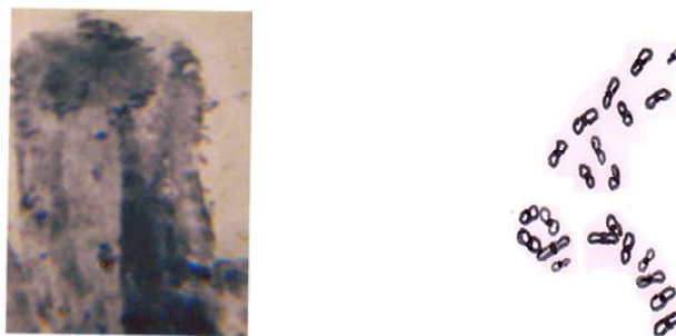
Fig. H. Polar View of metaphase from a root tip cell of A.precatorius . L (Red Black Seed Variety) Showing 22 Chromosomes