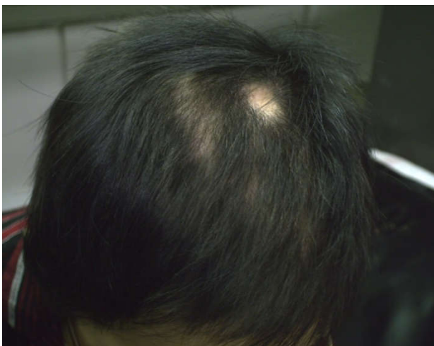
Fig. 3. Patch of AA ,one month after discontinuation of treatment

On examination, no hair follicles in the lesional area were found and also there were no scaling or erythema. He had no other dermatological manifestation except a lesion of Tinea in right forearm. Following phenotypic features were