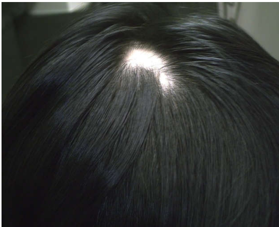
Fig1: Oval shaped patch of AA in parietal region of scalp

cm. In frontal region there was also extensive area of alopecia which made him a wide forehead person (Fig-6).