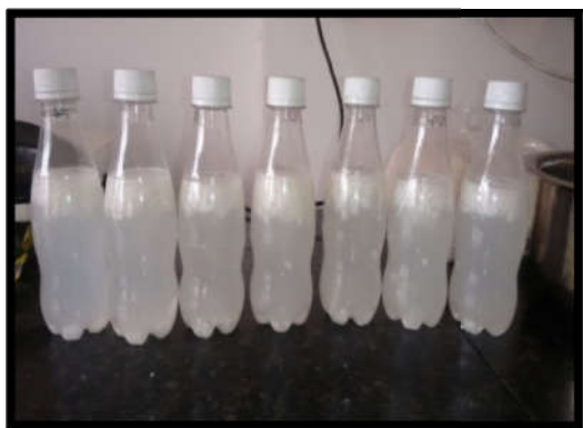
Fig.1. Mention below shows green coconut water preservation in plastic bottle for shelflife study