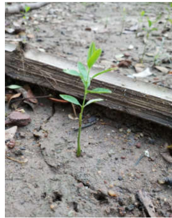
Fig.2. 14 days seedling in the nursery