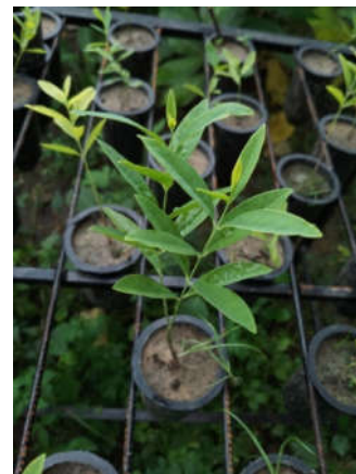
Fig.6. Healthy seedling before final plantation