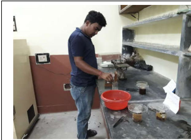
Fig.1. Weighing of seeds before soaking