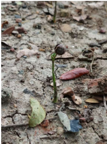
Fig.3. Sprouted seed in the nursery bed