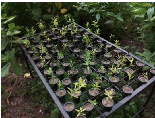
Fig.5. Hycopots in modern nursery cage