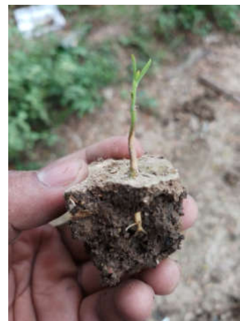
Fig.4. Seedling transferring into hycopot