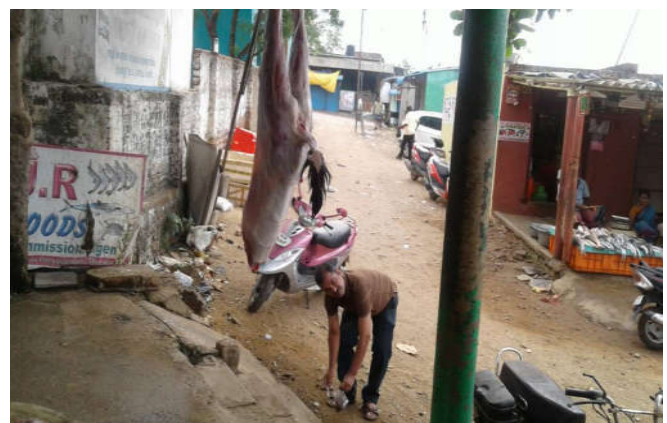
Plate 1. Sample collection

A total of thirty bacterial isolates were obtained from Soil samples of Butcher shop using skim milk medium.