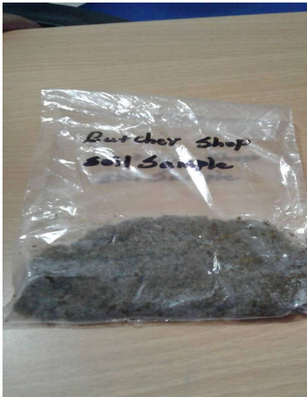
Plate 3. Collected sample