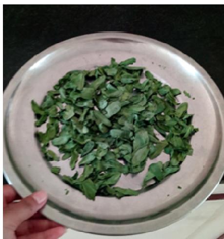
Fig.1. Dried leaves

The leaves are dried in hot air oven at a temperature of 60°C for 45 minutes. The drying characteristic of leaves is Checked at interval of 15 minutes.