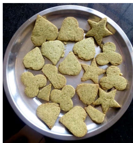
Fig. 3. Cookies

The cookies are baked at 180°C in OTG oven for 20 minutes.