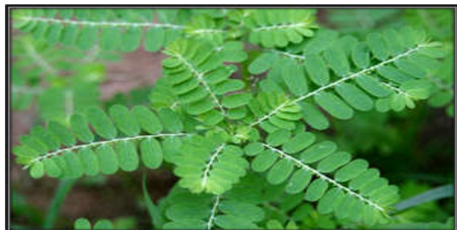
Fig.1. Phyllanthus amarus

inoculated plates were incubated at 37°C for 24 h to determine MIC of the extract against the microorganisms (Kavit, 2014 and Velraj, 2013). Antibacterial activity was then also tested by the disc diffusion method (Misbah, 2013).