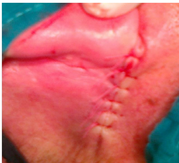
Fig. 2. Postoperative healing process

Both aging and cumulative sunlight exposure were found to be independent contributory factors. Different from us K. K. Luen et al. , 2016 reported unusually large sizes of seborrheic keratosis - patient was a 75-year-old male with no known medical illnesses who had a large, painless, pedunculated lesion on the right side of his face for the past 30 years. Clinically, there was a 20 × 15 cm oval-shaped pedunculated lesion, which appeared with an uneven surface and verrucous-like at the right temple, pulling down the right lateral upper eyelid, firm in consistency, mobile and with a well-demarcated stalk at the base. The development of basal cell carcinoma (BCC) in seborrheic keratosis (SK) is rare. Review of over 10,000 biopsies from SK revealed fourteen cases (Mikhail and Mehregan, 1982). Dermatopathology is the practice of assessing cutaneous diseases at the cellular level by performing microscopic examination of skin biopsy tissue samples. Histologic examination is a valuable diagnostic tool, frequently affecting treatment decisions (Chung et al. , 2015). Basal cell papilloma containing melanin pigment producing macroscopically visible warty projections from epithelial surfaces. Commonly papilloma derived from the basal cells. According to K. J. Busam, 2010 pigmented subtype may be clinically confused with other pigmented lesions, such as malignant melanoma and melanocytic nevus.