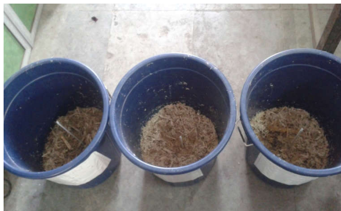
Figure 2. Temperature maintaining in control (Bagasse) experimental set up