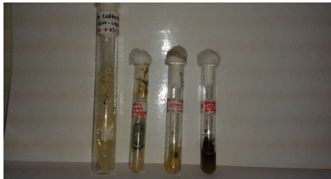
Figure 1. Fungal bioinoculants pure cultures from authentic Research Institutes

G. Chemical analysis: Analysis of Cellulose done by Anthrone method, Hemicellulose and Lignin by Reflux method (Sadasivam, S. and Manickam A. 2005).